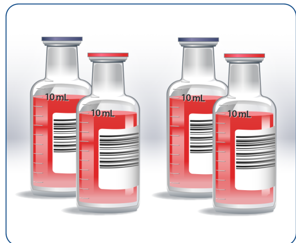
Representation of two blood culture sets with an aerobic and anaerobic bottle in each set, showing 10 mL of blood collected in each bottle for a total volume of 40 mL.